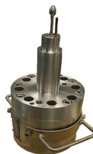
Model TOVL For Vessel and Extruder Installations