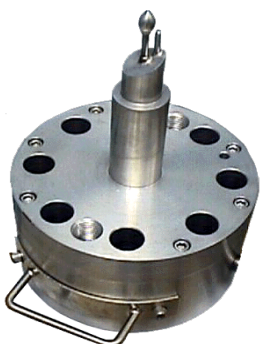
Model TOVS For Pipeline, Vessel, and Extruder Installations

Model TOVS Probe shown as example. Specifications above are for Model TOVS Probes. Operating temperatures vary by model.